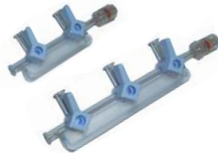
Half Body (HB)