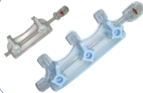
Block Body (BB)